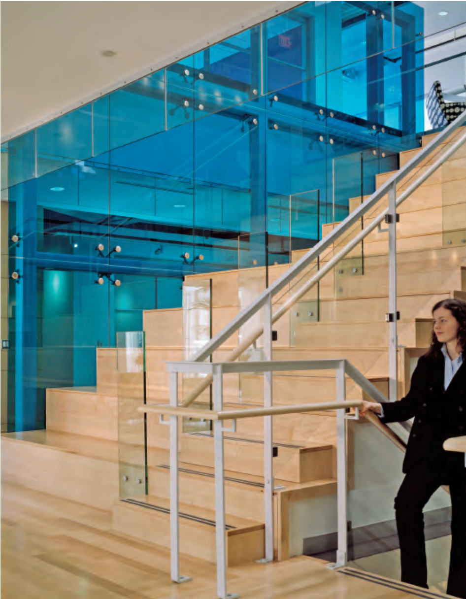
This inspired structure serves as both staircase and grandstand-type seating for company meetings and events.

of Troy building, a dark wood and marble-clad enclave in the heart of the suburban office market. "We're in a collaborative business, and it worked against people working together," said Neel.