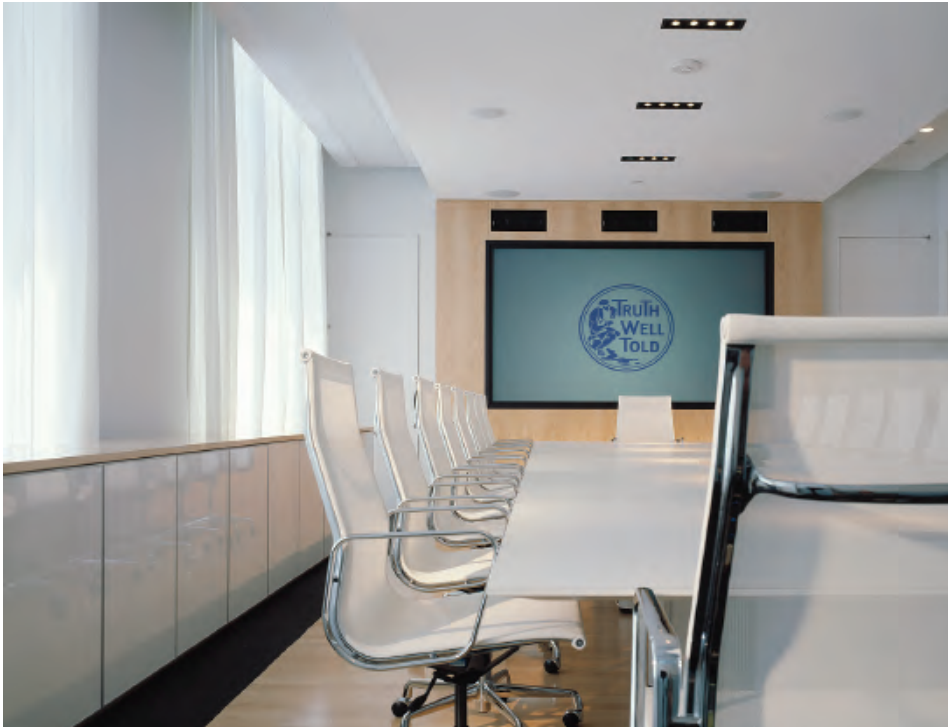
McCann's Client Presentation Room has a refreshing lightness that offers the perfect setting for communicating bright ideas.

lating into 12-foot-tall windows on the upper and 10-foot-tall windows on the main level. It's the reverse of what you would typically see in a commercial building."