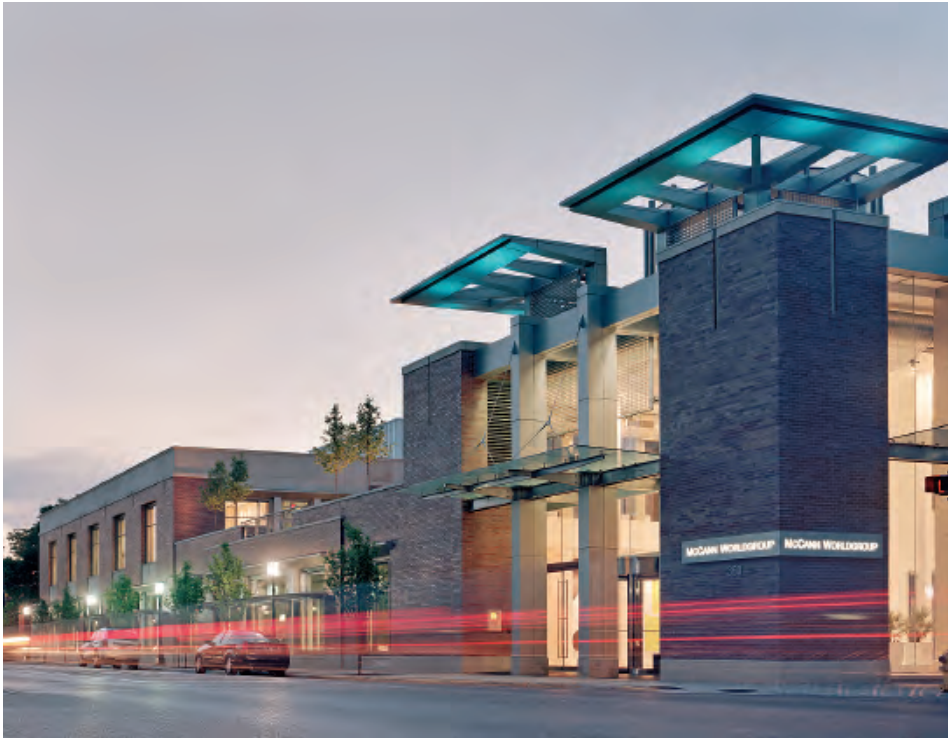
The building's newly constructed rooftop terrace and two-story lobby grace the streets of Birmingham.

a vibrant building where people can walk in and actually feel the energy." McCann also wanted a classically creative building rather than a trendy interior that was radical, outlandish and quickly dated. "I think ten or fifteen years from now this interior will still feel contemporary and fresh," said Neel.